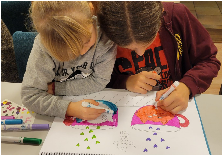
Therapeutic coloring in pairs

3-legged walking together using ribbons -- each child with a staff member